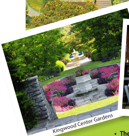
Kingwood Center Gardens