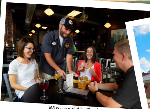
Wine and Ale Trail