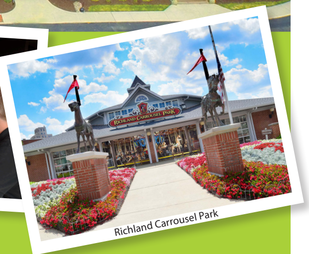
Richland Carrousel Park